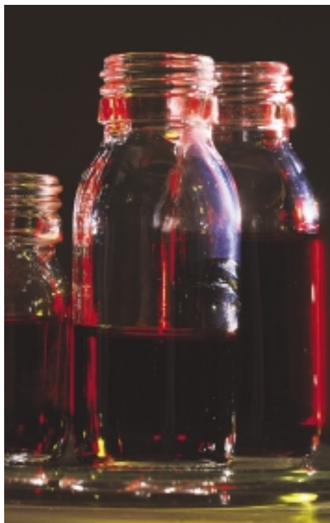
Samples of rhodium nitrate, a key component of many gasoline autocatalysts.

than earlier models, reflecting the introduction of strict limits on NOx emissions from the mid-1990s onwards.